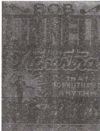
Original Poster for the Band

Regular gigs were booked on Wednesday and Saturday nights at Chateau Paulette near Park Rapids and the River Inn in Alderich, Minnesota. They also played at clubs in Bar Harbor, the Brainard Minnesota Pavilion, and the pavilion in Leaf Lake, Minnesota. These were resort areas that provided a good draw for their Benny Goodman style of swing music, offering up the fox trot, the two step, the polka, and the schottische. Door admission was 10 cents for ladies and 25 cents for men.