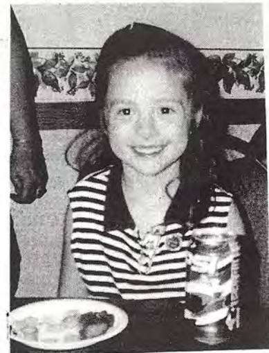
Cute enough to be a Linnell, but no name tag.