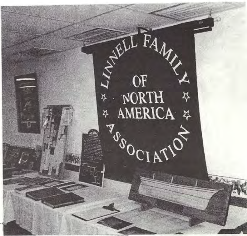
The Family Room Displays