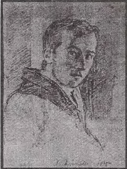
Self Portrait of John Linnell at age 23

JOHN was born in Bloomsbury, England and began his art career at the tender age of 8. He began an apprenticeship under painter John Varley at age 12, and entered the Royal Academy Schools at 13 where he won a medal five years later. It was at this time that he began teaching others. By 1817, when he married Mary Ann Palmer, John was engaged in the lucrative business of painting portraits on commission. But although he was forced by economic necessity to paint portraits for several years as a means to support his wife and nine children, his real love was expressing himself and his new-found Baptist religion by painting poetical landscapes of the English country side.