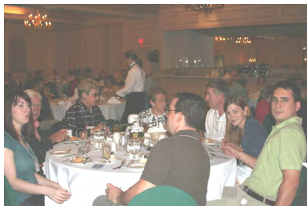
Saturday night banquet