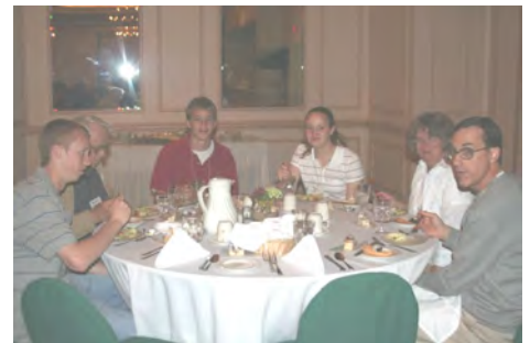
Young Linnells at the banquet