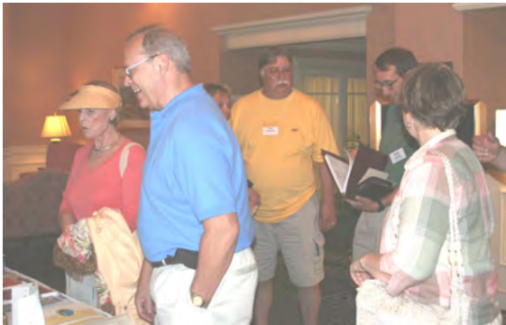
Cousins at the Registration Desk

We had such a wonderful time at the 2006 reunion on Cape Cod. For those who couldn't be there, we'd like to show you some pictures of the fellowship that we shared as cousins and family. For many, it was a time to see close family members again, and for others a chance to meet family for the first time. Here are a few of the Linnell family scenes from Cape Cod. We hope you are coming to the Linnell Family Reunion this June in Rockford, IL.