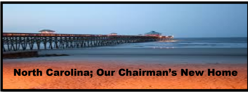
North Carolina; Our Chairman's New Home