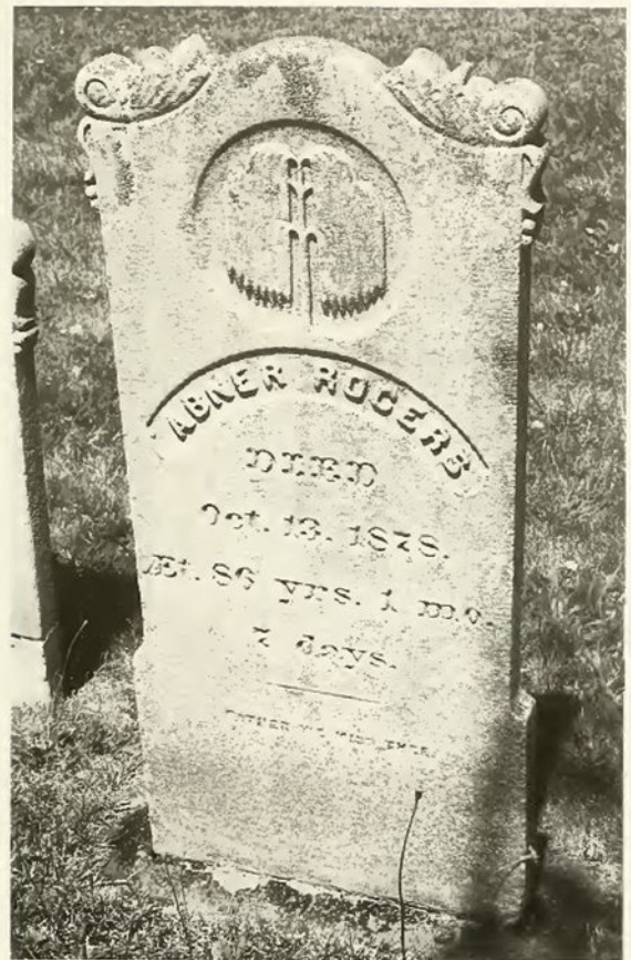
Fig. 10. Abner Rogers, 1878, Orleans, Massachusetts. Late Linnell willow.