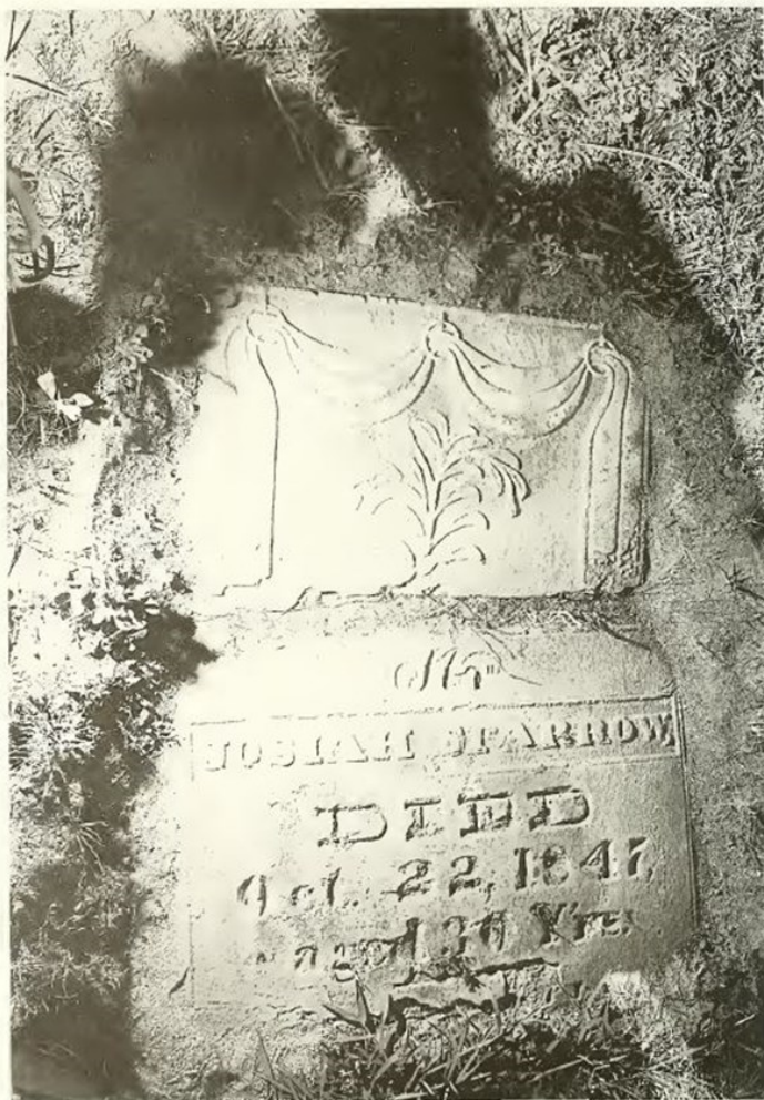
Fig. 1. Josiah Sparrow II, 1847, Orleans, Massachusetts. Carved by Oliver N. Linnell.