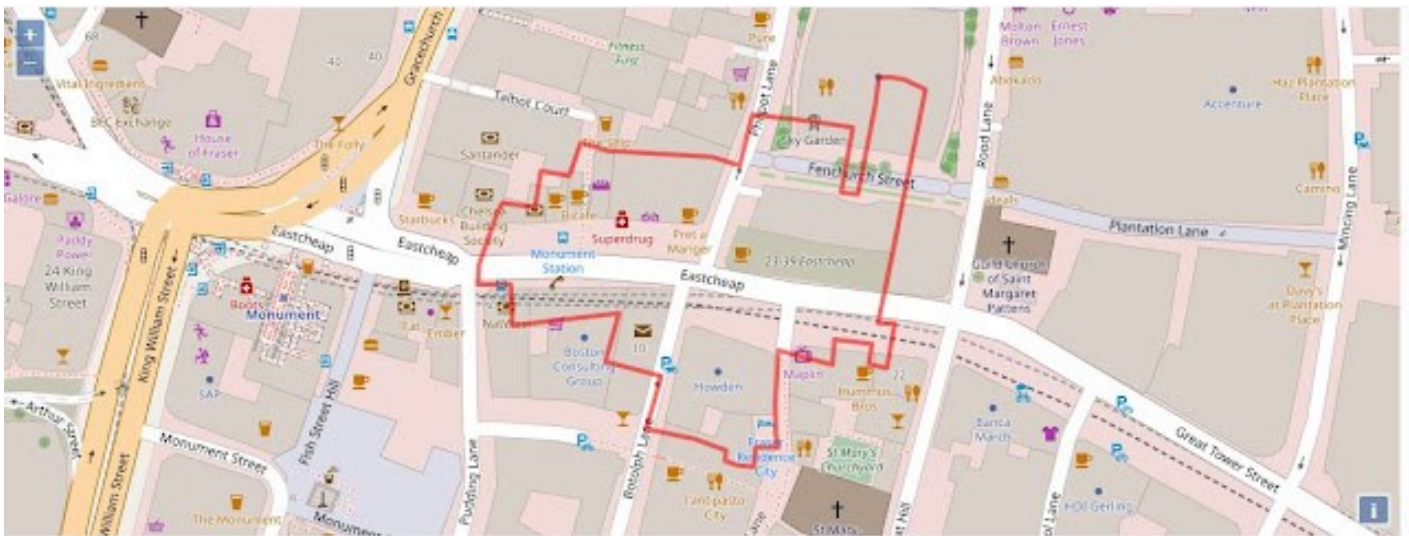
Old St Andrew Hubbard Parish