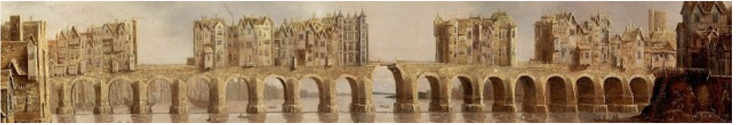
Old London Bridge - 1632 by Claude de Jongh