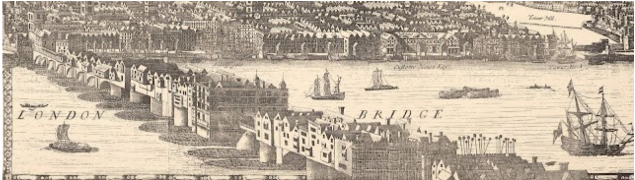
View of Billingsgate Ward and St. Andrew Hubbard in 1682